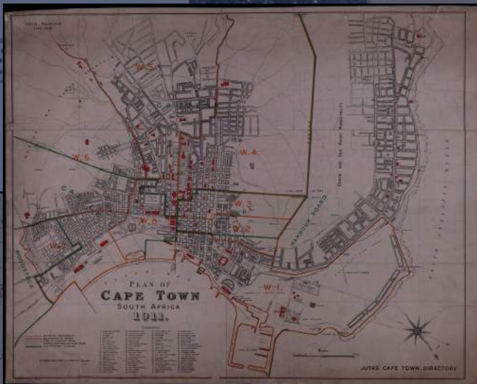
"Plan of Cape Town, South Africa." Map, 1911. Wiley Digital Archives: Royal Geographical Society (with IBG). Accessed 14 May, 2021.